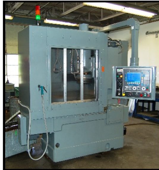
Finished No.11 Blanchard with 2-Axis Fagor CNC Control and full enclosure