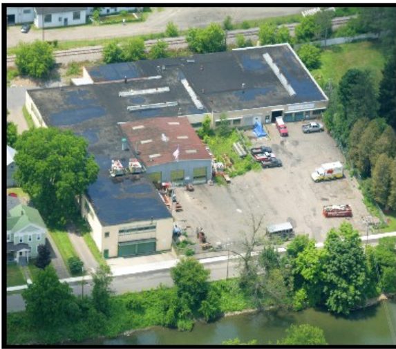
Overhead view of our main facility