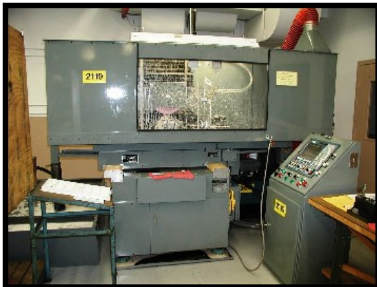
Niagara Falls/Fagor CNC Creep Feed Grinder

We invite you to visit our facility and inspect our rebuilding processes. If you have any questions please feel free to contact us.