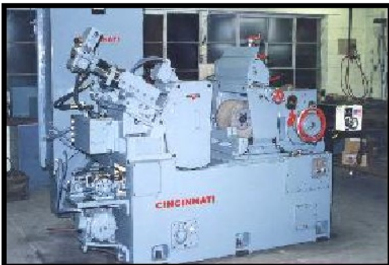
Cincinnati Centerless Grinder Re-Manufacture

Gallery Of Machines is a member of the Machinery Dealers National Association (MDNA), an organization which maintains a code of ethics among its members assuring their customers a high degree of integrity, reliability and technical expertise.