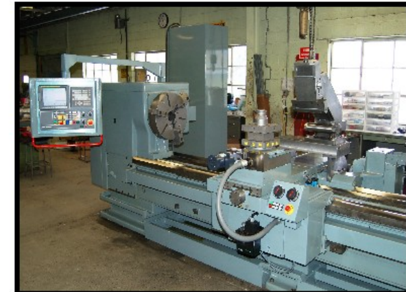
Finished Re-Manufacture with 2-Axis GE FANUC Control and custom follow rest.