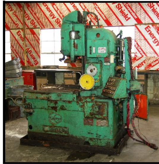
No. 11 Blanchard Before Re-Manufacture

Since opening our doors in 1979, we have performed hundreds of rebuilds & retrofits assembling a group of machine tool technicians with over 80 years of combined experience in the total remanufacture and retrofit of machine tools. Our machinists regularly make acme screws & nuts, spur gears, cluster gears, and other machine parts. We have our own in-house pattern shop, a complete fabrication shop with TIG, MIG, and stick welding capability, along with sandblasting & painting facilities. We do our own software design including computer generated prints and documentation.