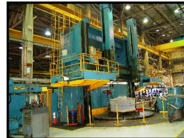
Morando VBM Rebuild & Retrofit