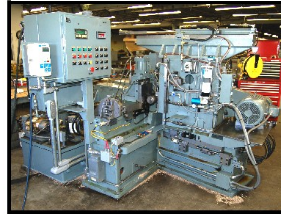
Stacy-Fitchburg Miller Re-Manufactured

REBUILDING & RETROFITTING : The major portion of our personnel are now involved in rebuilding machine tools to new tolerances for some of the larger corporations in New York, Pennsylvania, and much of New England . We have also engineered the installation of CNC controls on a number of machines including Blanchard rotary grinders, Elb surface grinders, and a 32" x 120" Monarch lathe. Our 5' x 5' x 20' Gray way grinder is holding .0001 per foot. This gives us the capacity to rebuild Bullard VTL'S, horizontal & vertical boring mills and DeVlieg Jigmils.